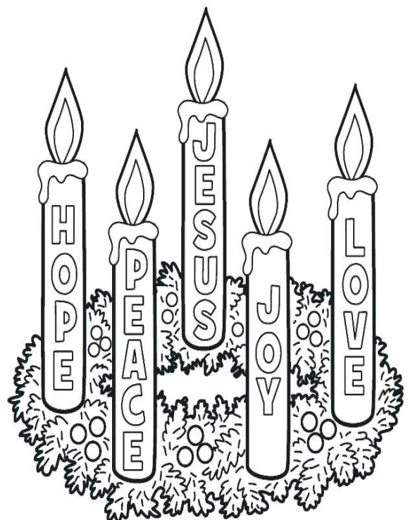
Colour the Advent Wreath

Is there something you/your family might do to brighten someone’s day ,in some small way?